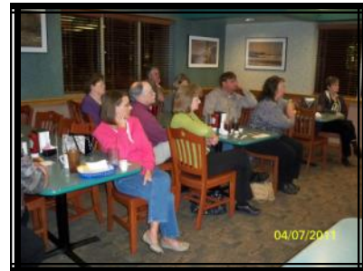
Columbia District Meeting

PAC for Postmasters will neither favor nor disadvantage anyone based on the amount of a contribution, or failure to make a voluntary contribution, to this non-partisan political action fund.